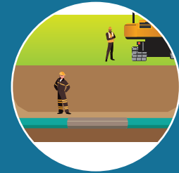
Hi-Grade Steel & Protective Coatings